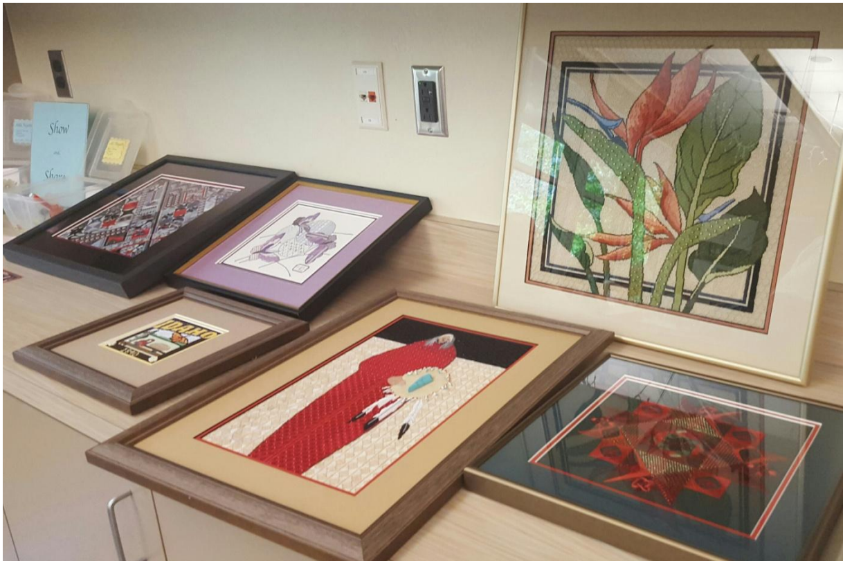
Above: Some of the beautiful finishes shared at our September meeting.

Newsletter articles due by November 11. Next due date is January 13, 2018