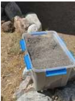
A bin full of freshly stripped lavender. A Heavenly fragrance.