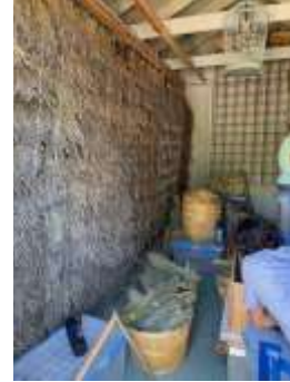
Lavender drying shed. The lavender is dried for one year before removal from stalk