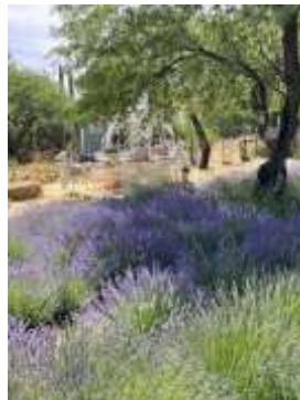
Lovely Cinderella carriage in a field of lavender